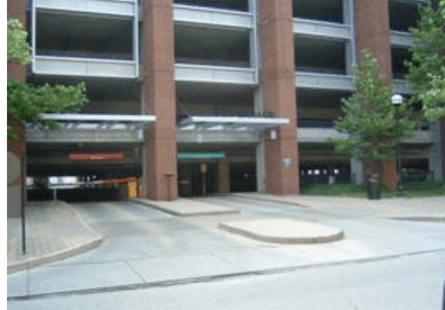
Entrance to visitor parking in Eden Garage. Enter from Eden Avenue. Park on levels 7 or 8 only.

Room G-27, Ground Floor, Kettering Laboratory, University of Cincinnati Medical Center Park in Eden Garage.