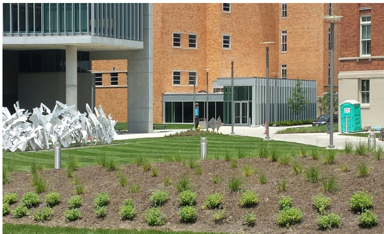
Entrance to Kettering Lab (center of picture) looking northeast from Eden Garage.

Free parking is available only if you park in the Eden Garage and bring your parking ticket for validation. Room G-27 is on the ground floor and adjacent to the Front lobby (currently under renovation). Visitors must only park on levels 7 & 8 of the Eden Garage. See more photos on next page.