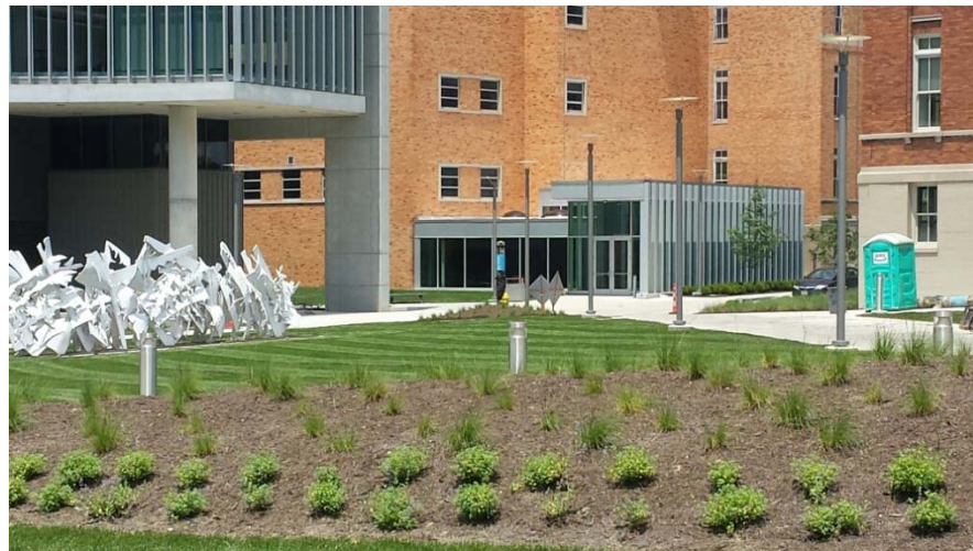
Entrance to Kettering Lab