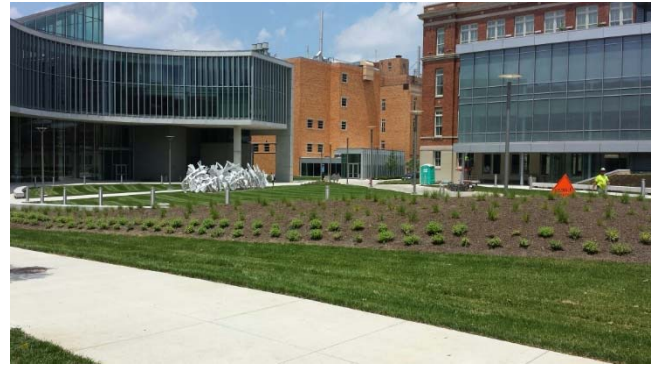
View from Eden Garage