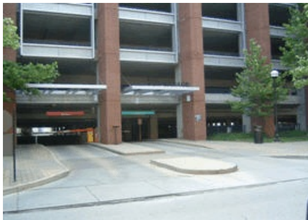
Entrance to visitor parking in Eden Garage. Enter from Eden Avenue. Park on levels 7 or 8 only.

Room G-27, Ground Floor, Kettering Laboratory , University of Cincinnati Medical Center Park in Eden Garage.